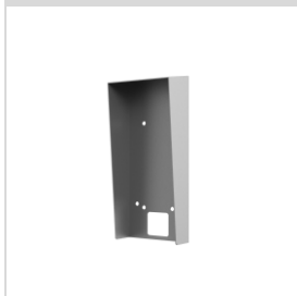
DS-KAB502-S1 Protective Shield